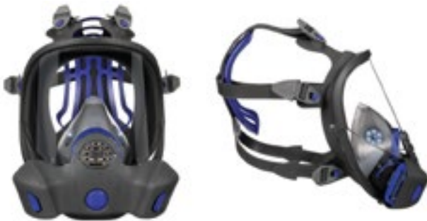
Figure 1: FF-800

All facepieces in the FF-800 range have the 3M™ Secure Click™ filter connection mechanism allowing connection to a broad range of 3M™ Secure Click™ filters to help protect against gases, vapours and/or particulates depending on your individual needs.