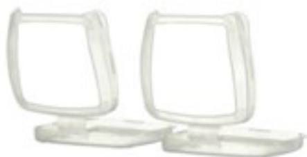
Figure 2: D701 Retainer