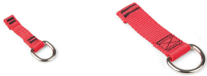
H01005 Tool Catch (12mm x 55mm) Max Load: 1.0kg/2.2lbs

GRIPPS® Tool Catch & V-Gripp Tape Models: H01005, H01006, H01007, H01010