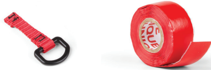
H01007 Tool Catch (Non-Conductive) Max Load: 1.0kg/2.2lbs