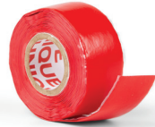
H01010 V-Gripp Tape Width: 2.5cm/1.0" Length: 2.7m/106"